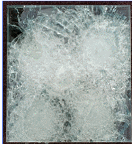
Sample 12 Post Test Rear Side