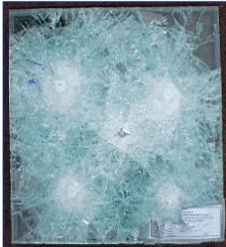
Sample 12 Post Test Impact Side

Sample 12: MWGF-NIJI3IA-UL3-ENBR4 - D.O.M. November 14, 2019 - CFR NIJ IIIA EN BR4 UL Level 3 - NIJ III-A Part 2 - 12.01 x 12.01 x 1.302 in.